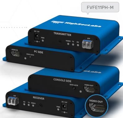
DP/HDMI Combo Connector

HSL has a full range of secure extension products supporting PoE, TEMPEST, NIAP PP4.0 PSD, and MIL-SPEC.