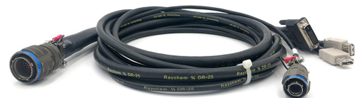
Rugged Product Cable Sample