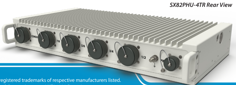
SX82PHU-4TR Rear View

Receive the unit's operational readiness status and diagnostics via RS232. BIT results are reported upon startup, on demand and continuously every 5 minutes.